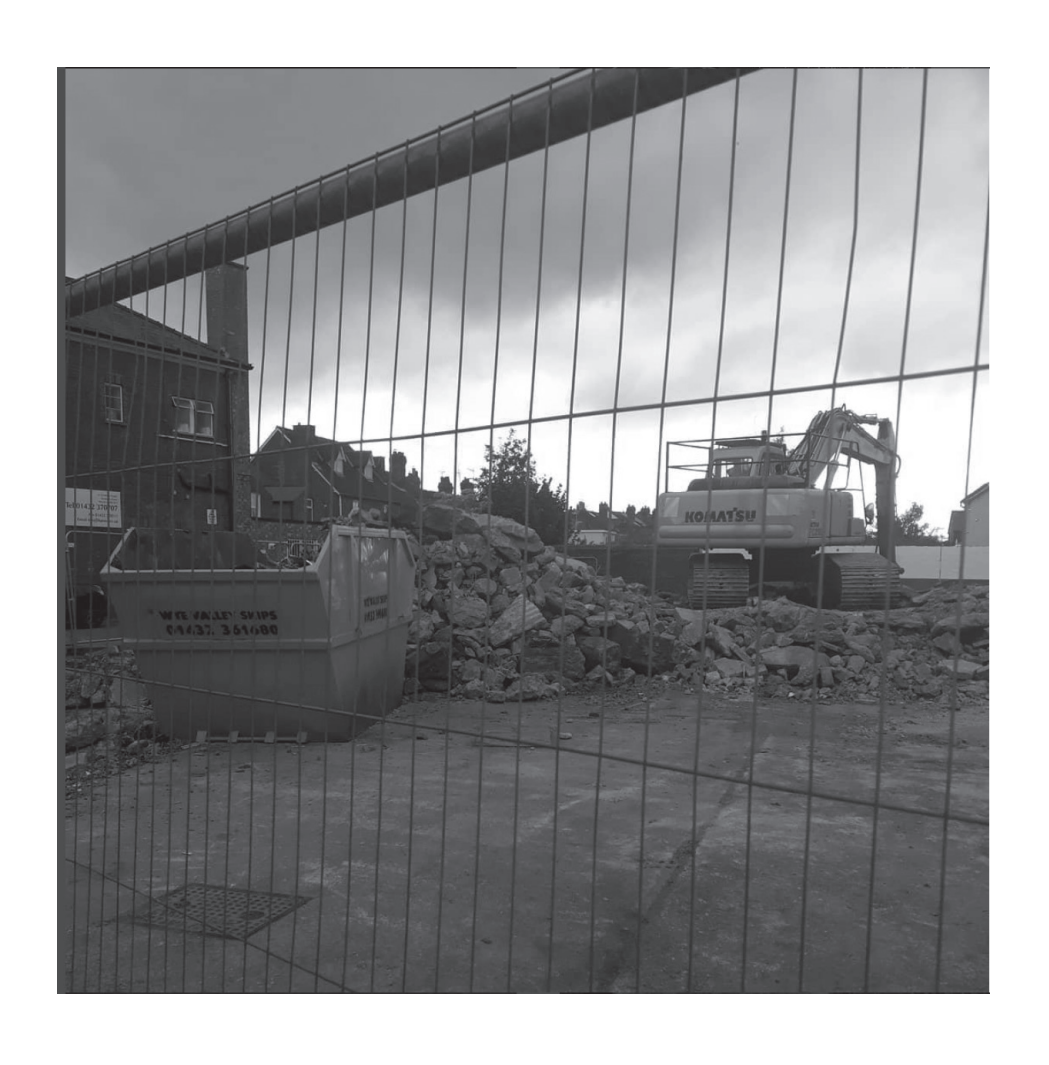
Site of former snooker hall, Ryelands Street