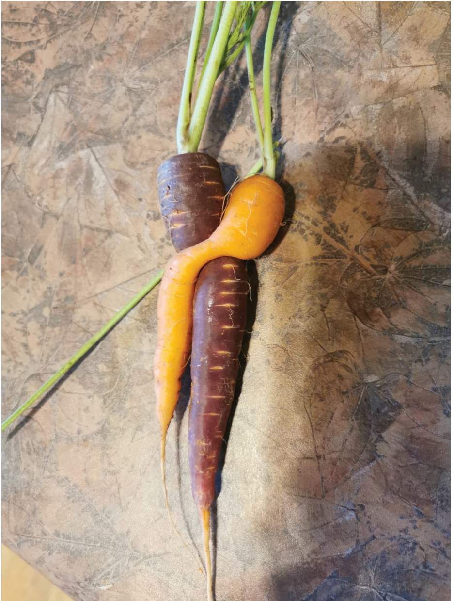
l u c y f a r r e l l